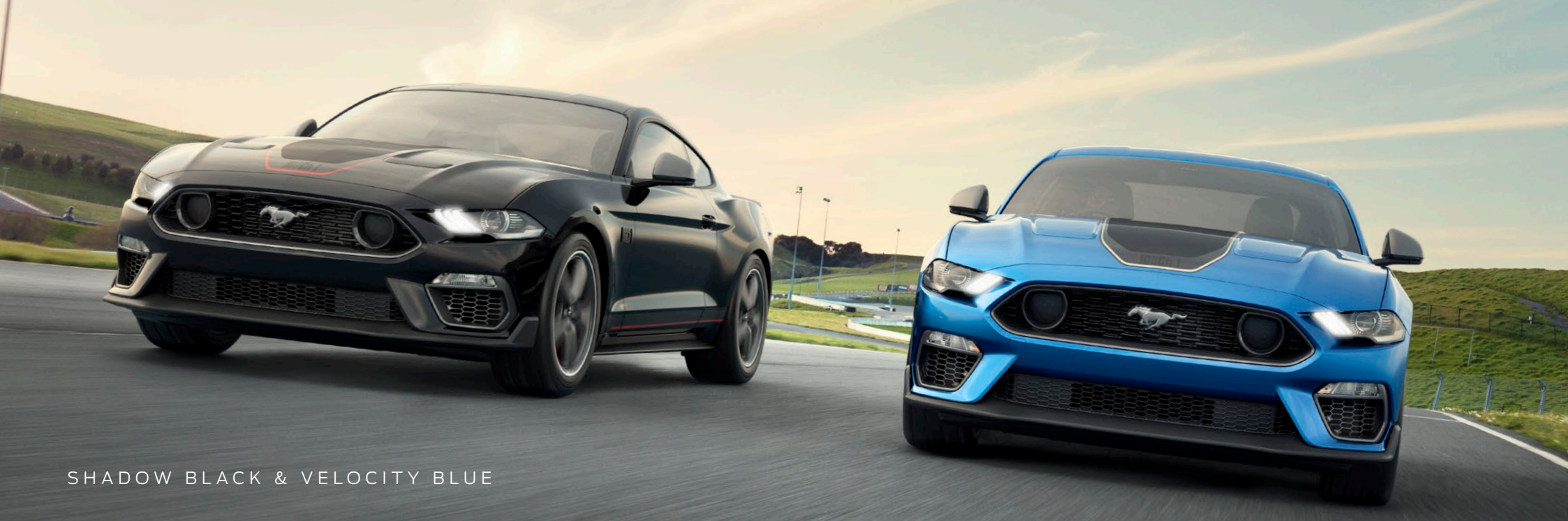
SHADOW BLACK & VELOCITY BLUE