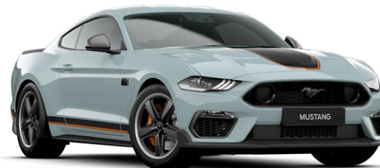
FIGHTER JET GRAY*